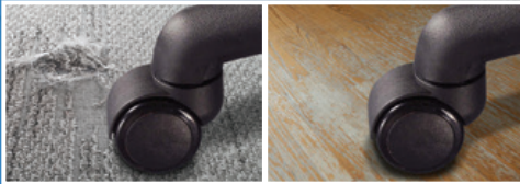
Don't let this happen to your flooring!